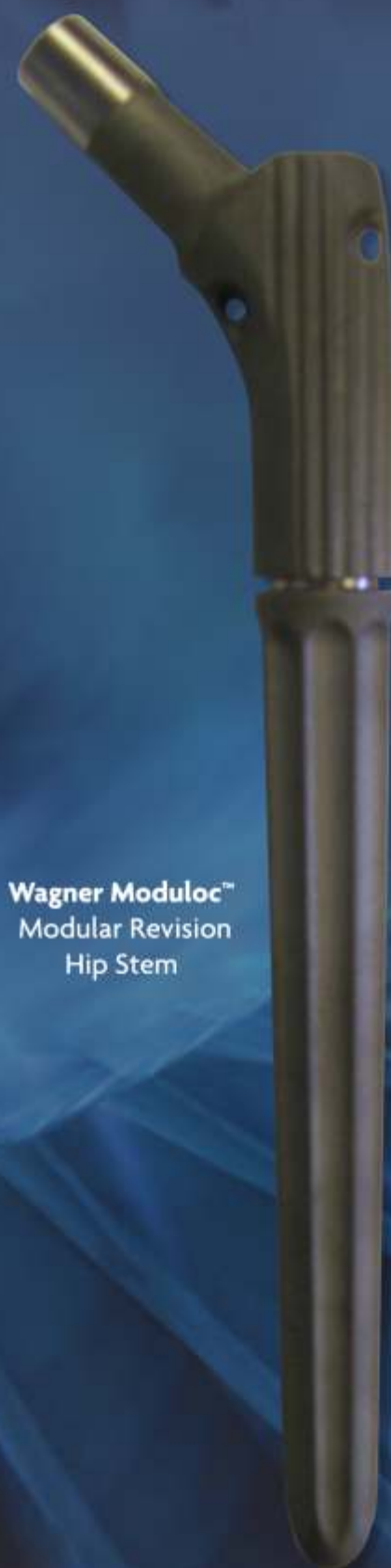
Wagner Moduloc™ Modular Revision Hip Stem

WAGNER MODULOC™ MODULAR REVISION HIP STEM