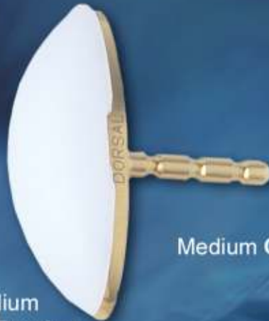
Medium Carpal Implant