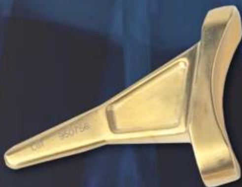
Large Radial Implant