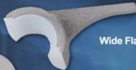
Wide Flanged Ulnar